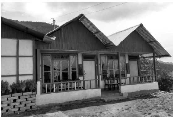
Figure 1: 'Homestay' in Icchey forest village

The present study seeks to analyze how the tribals of Icchey and Dhotrey forest villages are adopting new alternatives as means of livelihood and how tribal women are adjusting themselves to these economic changes. Previously, the villagers of Icchey forest village were totally depended on agriculture but presently most of them are shifting their focus to other economic activities especially 'homestay' which is generating higher earnings for them without a great deal of effort. Women of Dhotrey forest village also play an important role to supervise the 'homestay' tourism. The areas which were meant for doing agricultural activities are now used for constructing buildings/houses for promoting 'homestay' tourism. Only some of the villagers are still depended on agriculture. The socio-economic scenario of the village is going through total change. Although they are busy with their new economic activities they also manage to look after their respective household chores. Higher income led to higher consumption and spends more on food, housing, health, education etc.