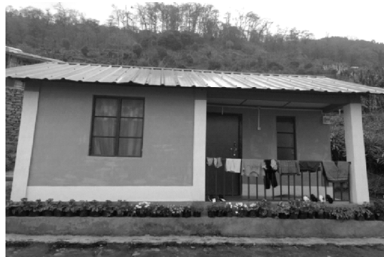
Figure 2: Sherpa Development Board sponsored house modified into 'homestay'

They are now economically sound and self-dependent. Majority of the respondent possess modern amenities. Vehicles are used for carrying out tourists from one place to other places. They also saving money which they deposit in banks, post offices etc. At present, they admit that their children are studying in good schools and colleges. One of the school teacher of Icchey forest village stated that she